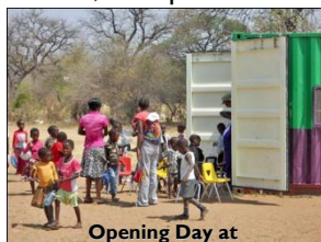
Opening Day at the new container school

the school. The kindergarten project is an unexpected bonus of the successful Bike Shop! Nkurenkuru, Namibia now gets a kindergarten that gives children a jump-start on their education. B4H values the contribution that education makes in providing the chance for these children to escape the cycle of poverty so prevalent in Namibia. B4H is thrilled to support this new school!