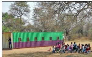
Kindergarten in the shade while finishing touches are put on the new container school

Profits from the very first B4H Bike Shop are being used to sponsor a kindergarten. A grant was written to the Namibian government by the Bike Shop manager to cover salary for a teacher, B4H provided the container and the Bike Shop supports